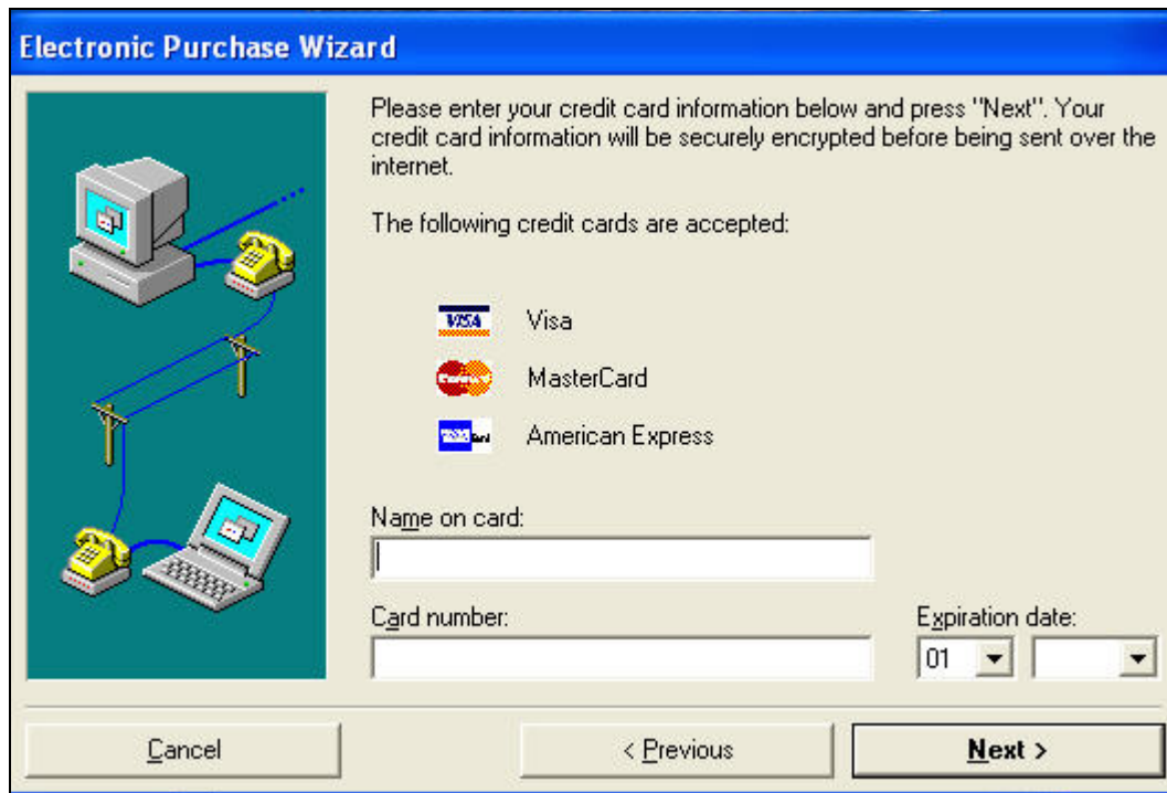
Figure 1-1 Electronic Purchase Wizard – eCommerce option

The Electronic Purchase Wizard (on the Client side) will look different to a Customer when using the eCommerce option than when using the eRegister option (see Part 2: Casper eRegister ). The Wizard for eCommerce will include fields for the credit card information, product code and price, as follows: